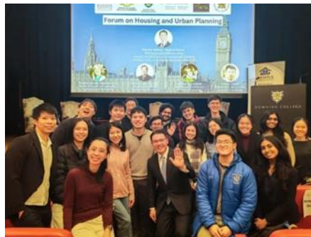
UN Habitat President cum Housing and local Govt Minister Nga Kor Ming delivers his keynote address at Cambridge university, Downing College.

PETALING JAYA: The Housing and Local Government Ministry has proposed to establish a Malaysia-Cambridge Urban platform to advance sustainable development goals under the Madani economic framework. Minister Nga Kor Ming said the initiative would strengthen collaboration with leading global institutions to address urban challenges and achieve the 2030 Sustainable Development Goals (SDGs). He said Malaysia's strong economic growth and improving global competitiveness reflect the nation's resilience as a formidable trading economy in Asia despite ongoing geopolitical tensions.