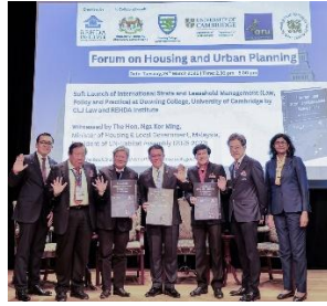
Nga (centre) with the Rehda Institute committee members during the launch.

KUALA LUMPUR: As Malaysia prepares for the transformative goals of the 13th Malaysia Plan, a high-level delegation, led by Housing and Local Government Minister Nga Kor Ming and Rehda Institute, has concluded a landmark strategic tour of the United Kingdom (UK).