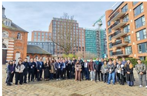
The REHDA Institute delegation after a visit to Gamuda Land UK's purpose-built student accommodation at Woolwich, London.

PETALING JAYA (March 27): REHDA Institute has embarked on its Asia Real Estate Leaders (AREL) Study Tour to the United Kingdom, with stops across London, Bristol, Bath and Cambridge, as part of its efforts to strengthen global knowledge exchange and leadership development within Malaysia's real estate sector.