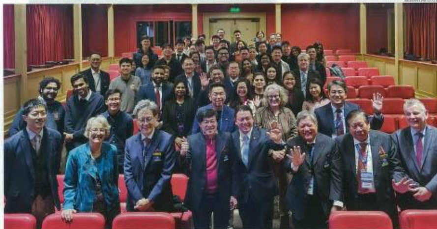
The AREL UK tour culminated in a forum hosted at Downing College in the University of Cambridge

Architecturally, the building has been described as a "ship-like structure" emerging from the dock, referencing Canary Wharf's maritime heritage. A defining element is the 300m timber lattice roof, one of the largest timber roof structures in the UK.