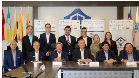
REHDA Institute Leads Malaysian Delegation to UK for Sustainable Urban Development.

PETALING JAYA (Mar 17): REHDA Institute is spearheading a high-level Malaysian delegation to the United Kingdom from March 19 to 25, focusing on sustainable urban regeneration, transit-oriented development, and housing reform. The mission, comprising senior developers, planners, legal experts, and government representatives, aims to gain global insights to strengthen Malaysia's urban frameworks and housing policies.