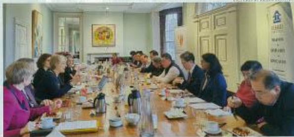
The closed-door meeting between the delegates and representatives of the University of Cambridge, University College London and Anglia Ruskin University

Walking through the early phases of the development, what dawned on us is how carefully the sequencing has been structured. Initial phases focus on establishing a residen-