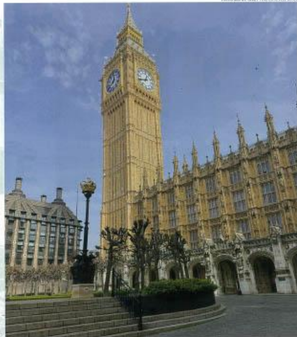
At the Palace of Westminster, the delegates were taken on a tour of the heritage building to learn about its history and workings

At the Palace of Westminster, which serves as the seat of the UK parliament, the delegation was taken on a tour of the building to learn about its history and workings. The building is undergoing a major restoration and renewal programme to address structural deterioration, modernise building services, improve fire safety and ensure the long-term preservation of the estate. Key challenges include asbestos contamination, ageing mechanical and