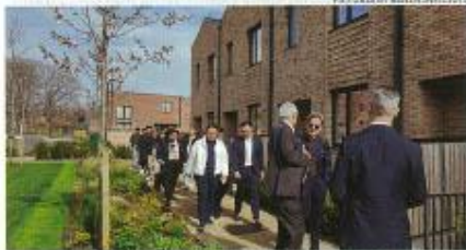
The delegates touring a housing project in Brabazon, Bristol (left) and the EdCity affordable housing development in West London