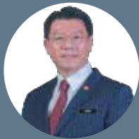
(The Honourable) NGA Kor Ming Malaysia's Federal Minister for Housing & Local Government