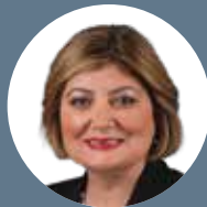
The Honourable Natalie Suleyman Minister for Small Business and Employment, Minister for Veterans, Minister for Youth Victoria State Government