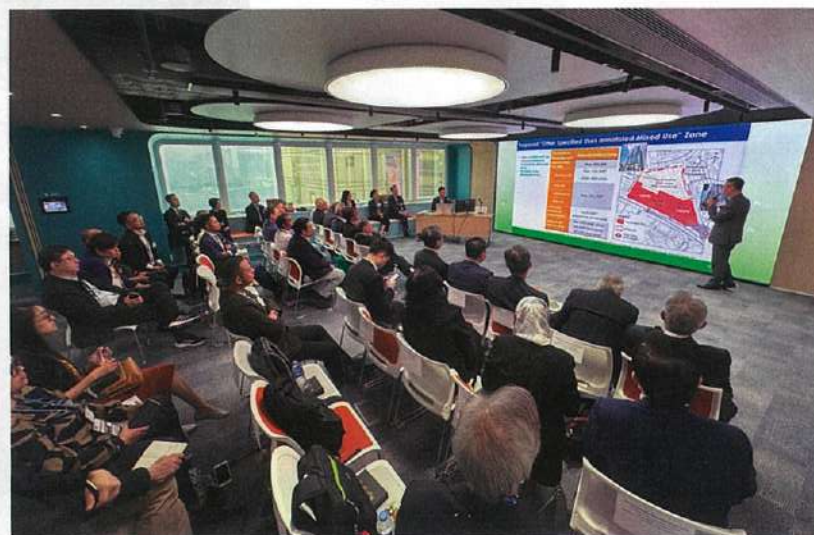
Delegates listening to URA's presentation on how it plans to upgrade the selected parts of Hong Kong

Kerry Properties showcased its luxury properties in a presentation: On Hong Kong island,