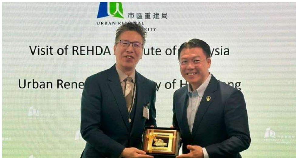
倪可敏(右) 赠送纪念品予香港市区重建局商务执行董事区俊豪。

(香港 8 日讯) 大马房屋及地方政府部长倪可敏指出，房地部正在拟定新公共房屋模式，并将之命名为“人民住宅计划” (Program Residensi Rakyat，简称 PRR)。