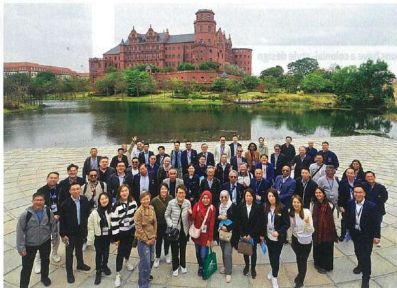
Visiting the Huawei Ox Horn Campus, a 300-acre development that houses the R&D division of Huawei

One of the challenges in Hong Kong is developing new structures with limited land and space. To deal with this issue, Hong Kong's Urban Renewal Authority (URA) was set up in May 2001 under the Urban Renewal Authority Ordinance. URA's main responsibility is to undertake, encourage, promote