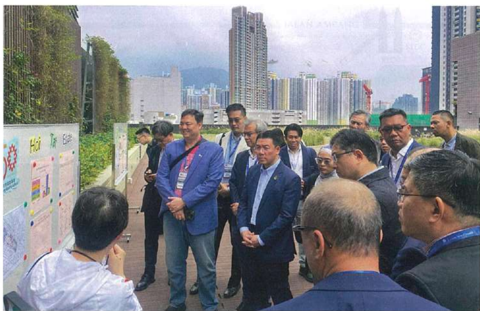
A representative from Hoi Tat Estate giving an overview of the mechanics of the social housing project