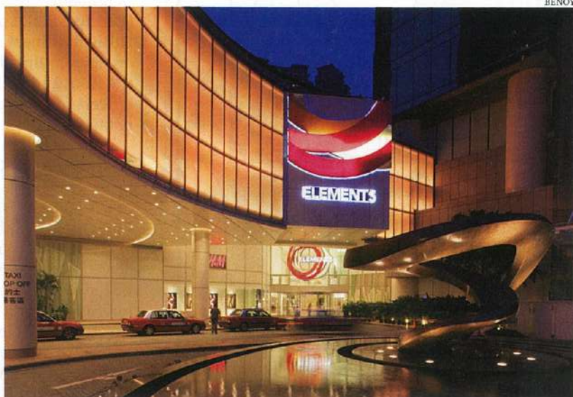
The Elements mall, sitting atop the Kowloon MTR station, is a component of the US$10 billion Union Square, the world's largest integrated development

The mall was designed by Benoy, an architecture, interior design, branded environments, master planning and landscape architecture firm. The mall is located above the Kowloon MTR station, which links to Central MTR station and the airport. The mall sits below the International Commerce Centre building and is surrounded by several residential towers, which feed footfall to the mall.