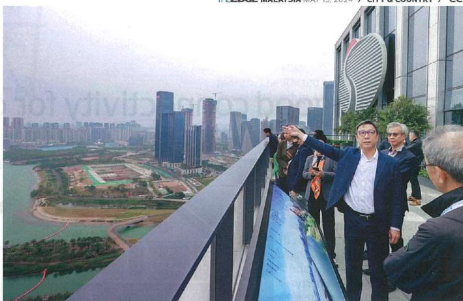
Getting a bird's eye view of Qianhai, which has been transformed by massive development and investment

it has high-rise developments, La Marina and La Montagne; and on the Kowloon side, the luxurious and exclusive Mont Verra and Mont Rouge.