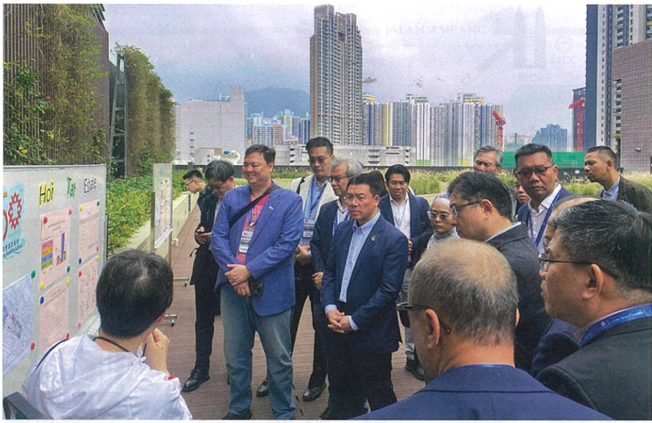
A representative from Hoi Tat Estate giving an overview of the mechanics of the social housing project