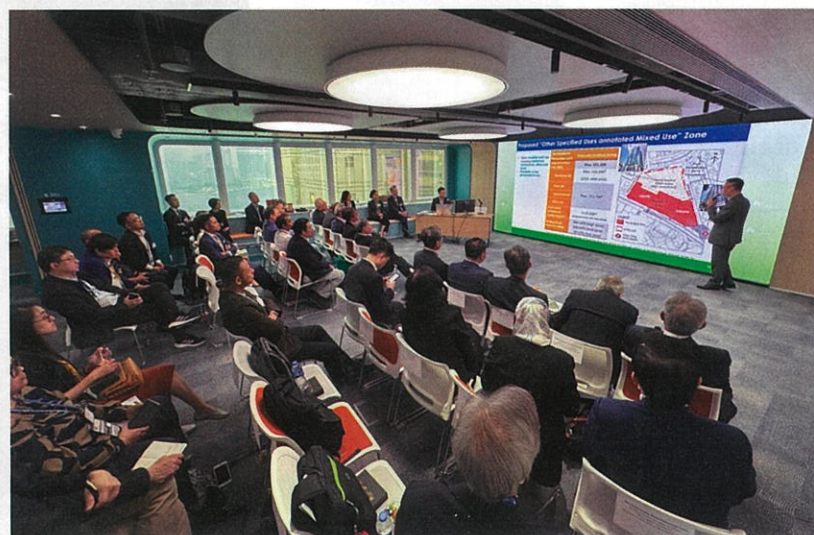
Delegates listening to URA's presentation on how it plans to upgrade the selected parts of Hong Kong

Kerry Properties showcased its luxury properties in a presentation: On Hong Kong island,