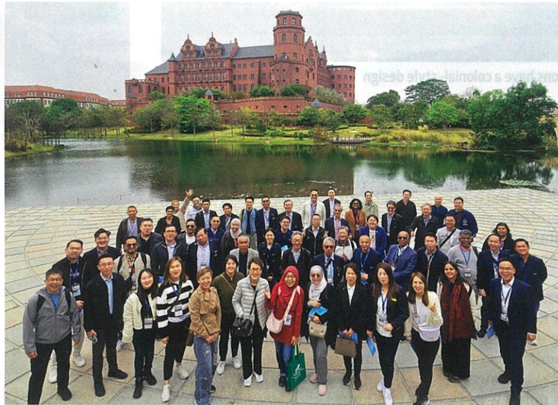
Visiting the Huawei Ox Horn Campus, a 300-acre development that houses the R&D division of Huawei

One of the challenges in Hong Kong is developing new structures with limited land and space. To deal with this issue, Hong Kong's Urban Renewal Authority (URA) was set up in May 2001 under the Urban Renewal Authority Ordinance. URA's main responsibility is to undertake, encourage, promote