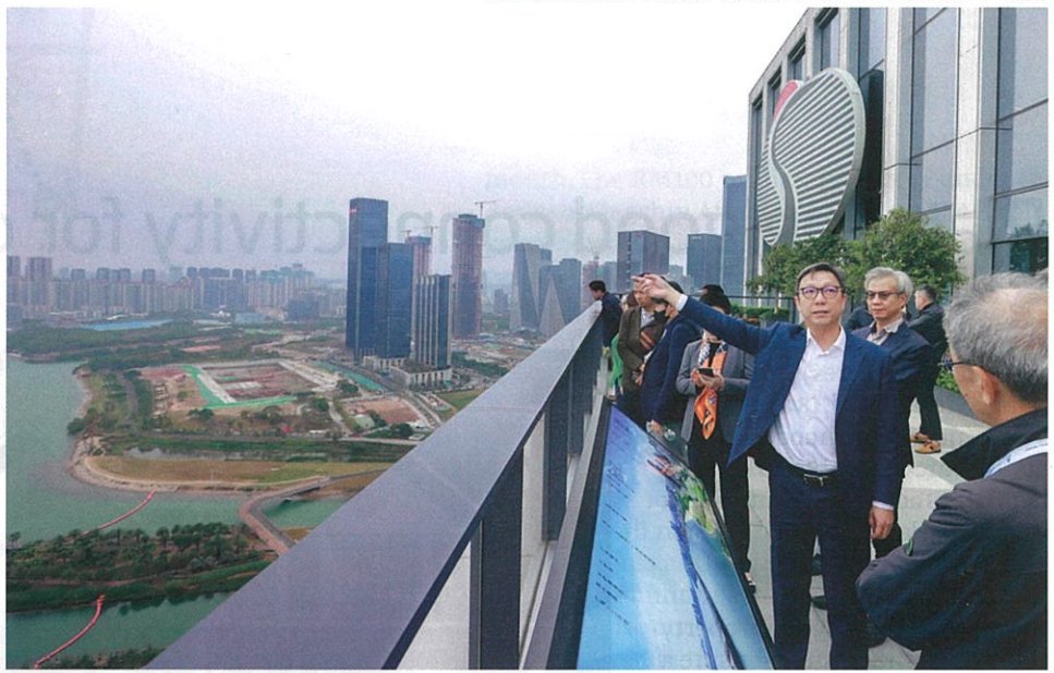
Getting a bird's eye view of Qianhai, which has been transformed by massive development and investment

it has high-rise developments, La Marina and La Montagne; and on the Kowloon side, the luxurious and exclusive Mont Verra and Mont Rouge.